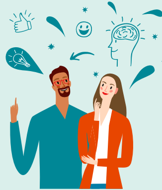
Leadership commitment to preventing bullying and intervening where it occurs