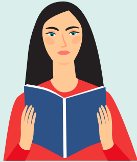
Strong and well-communicated policies and processes regarding bullying