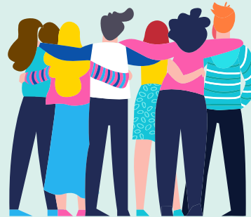
Practices that affirm diversity