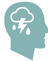
More reports of stress