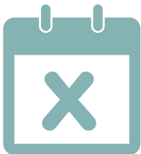
More sickness absence