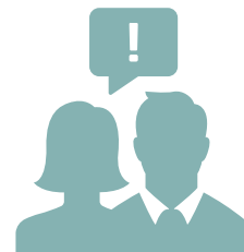
More complaints and grievances

When these signs are present or when staff raise concerns about stress, workplaces have a role and responsibility to assess the impact work may be having on their people's health and to take action to minimise, eliminate or manage.