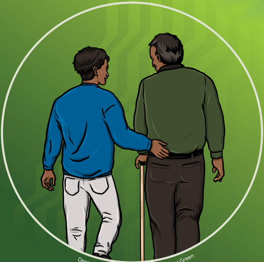
Design: Tiaki Terekia - Illustrations: Alex Green